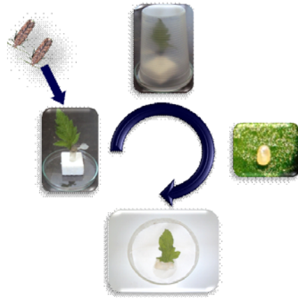
FIGURE 1. Esquema for obtaining Tuta absoluta eggs./ Esquema para la obtención de huevos de Tuta absoluta .

To determine the duration of the egg stage and their viability, T. absoluta couples were placed into a transparent acrylic glasses (6.5 cm, 8.0 cm diameter) for 24 hours. Each glass was fixed to a Petri dish (10 cm diameter) with an adhesive film. Each dish contained a leaf of the Vyta cultivar inserted into an Eppendorf tube with distilled water and supported to a polystyrene cube. Tomato leaves were used as oviposition substrate. The adults were fed with drops of honey. A few portion of this was placed inside of the glasses with the help of an entomological brush. After 24 hours, the excess of eggs present on the leaves were removed with a fine-tipped brush. Only, fifteen eggs were left per leaf. Ten replicates per each treatment were included ( n=150 ) The larvae hatched were counted daily (Figure 1).