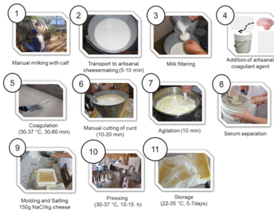
Figure 1. Flow chart of artisan fresh cheese production in Cuba./ Diagrama de flujo de la producción artesanal de queso fresco en Cuba.

Staphylococcal intoxication results from the ingestion of staphylococcal enterotoxins (SEs) produced during the growth of S. aureus in food (in amounts >10^5 UFC/g). The SEs are potent