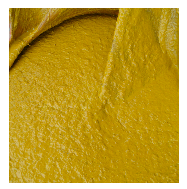
FIGURA 4. Vagal indigestion. Homogeneous rumen content with a foamy viscous consistency and an olive green color (case 03)./ Indigestión vagal. Contenido ruminal homogéneo con consistencia espumosa viscosa y color verde olivo (caso 03).