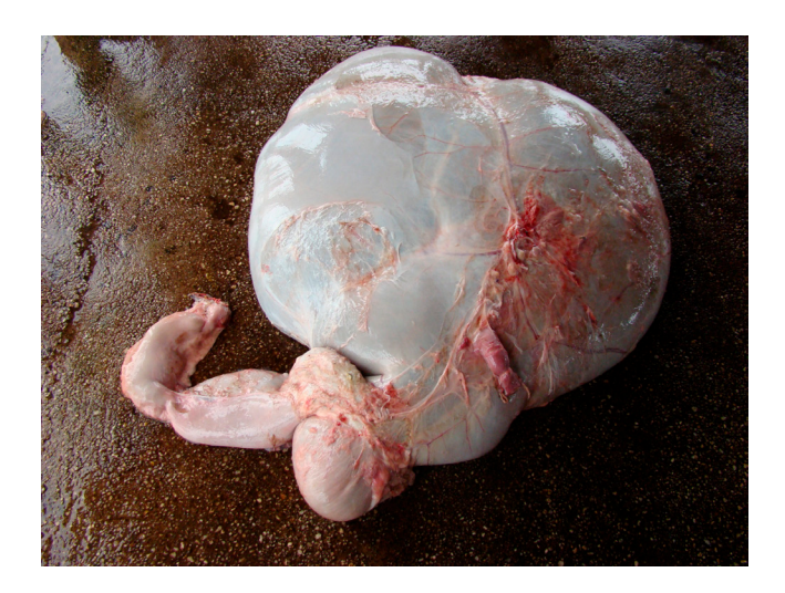
FIGURE 2. Vagal indigestion. Distended rumen, reticulum, compacted omasum and abomasum with scarce contents (case 02). / Indigestión vagal. Rumen distendido, retículo, omaso compactado y abomaso con escaso contenido (caso 02).